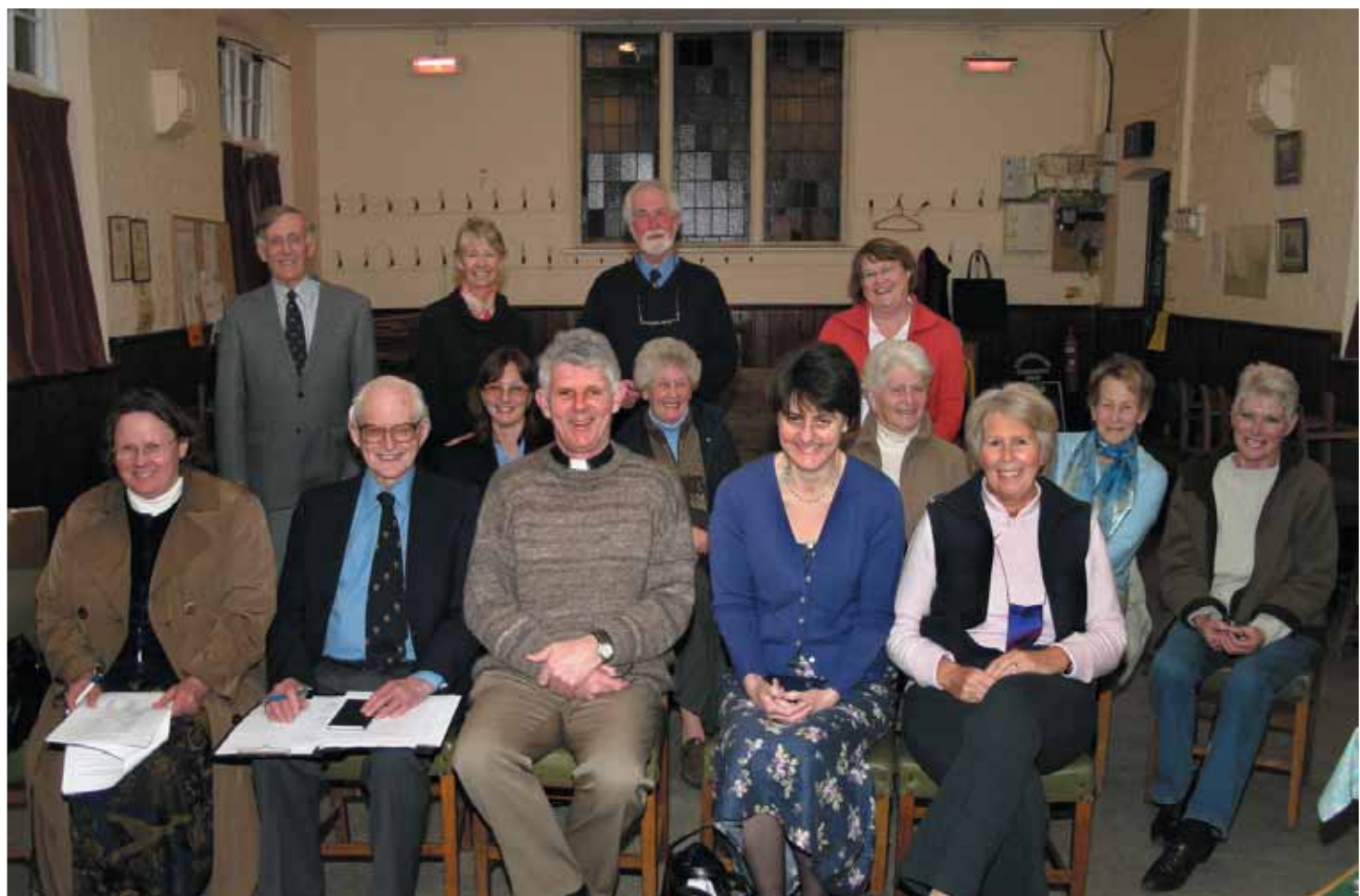
364 The Parochial Church Council