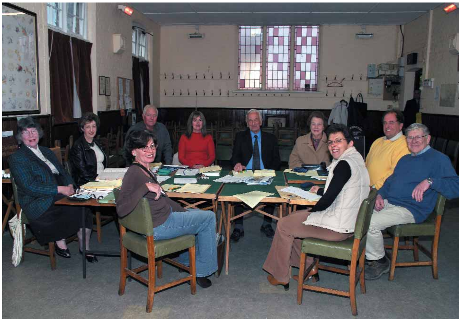
363 The Parish Council