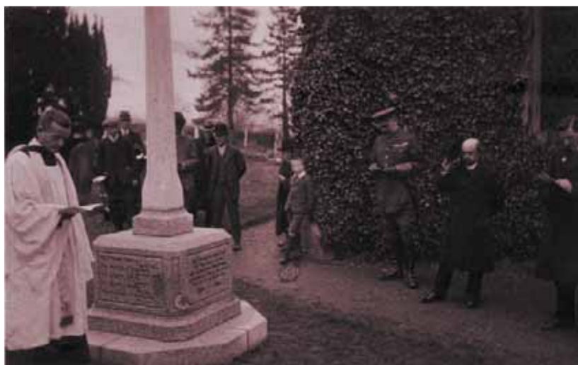
365 Canon Sproule: War Memorial Dedication 1927