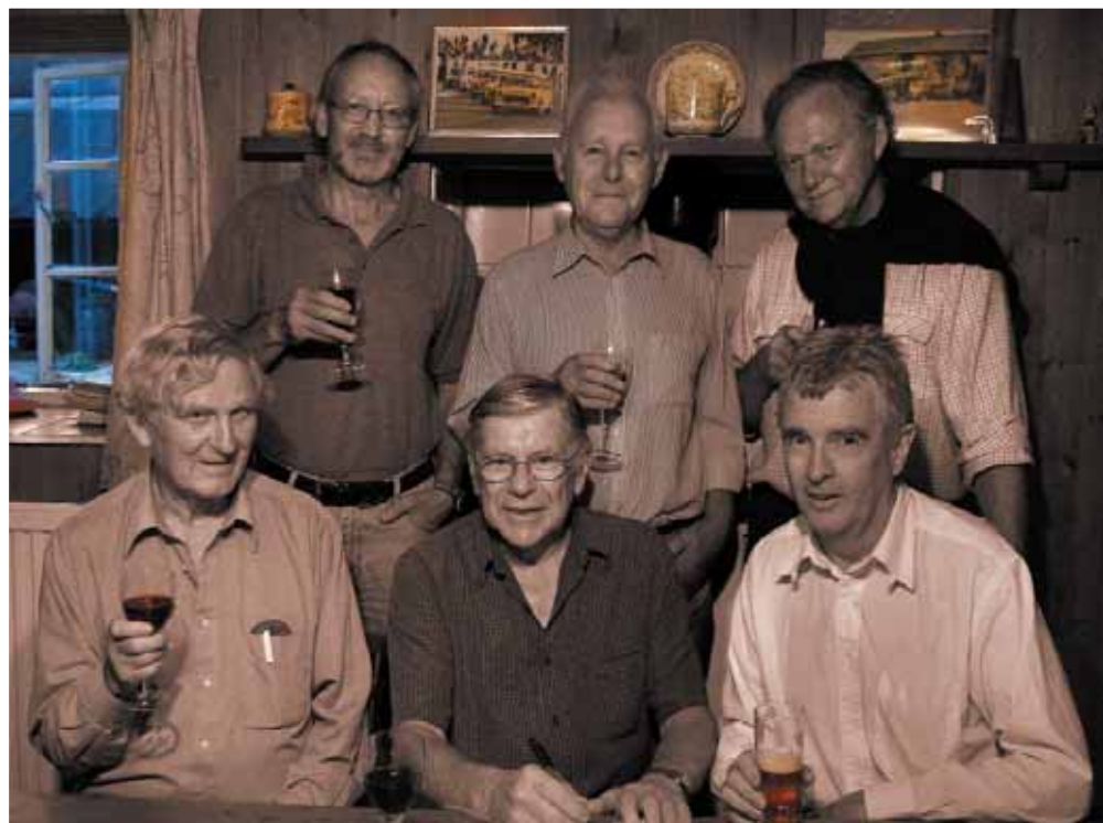
410 The Historical Trust